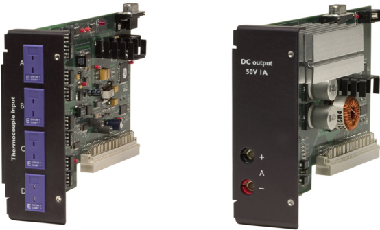
PTC330 Thermocouple Card PTC430 DC Output Card

isothermal block, with its own RTD temperature sensor, provides highly accurate cold junction measurements.